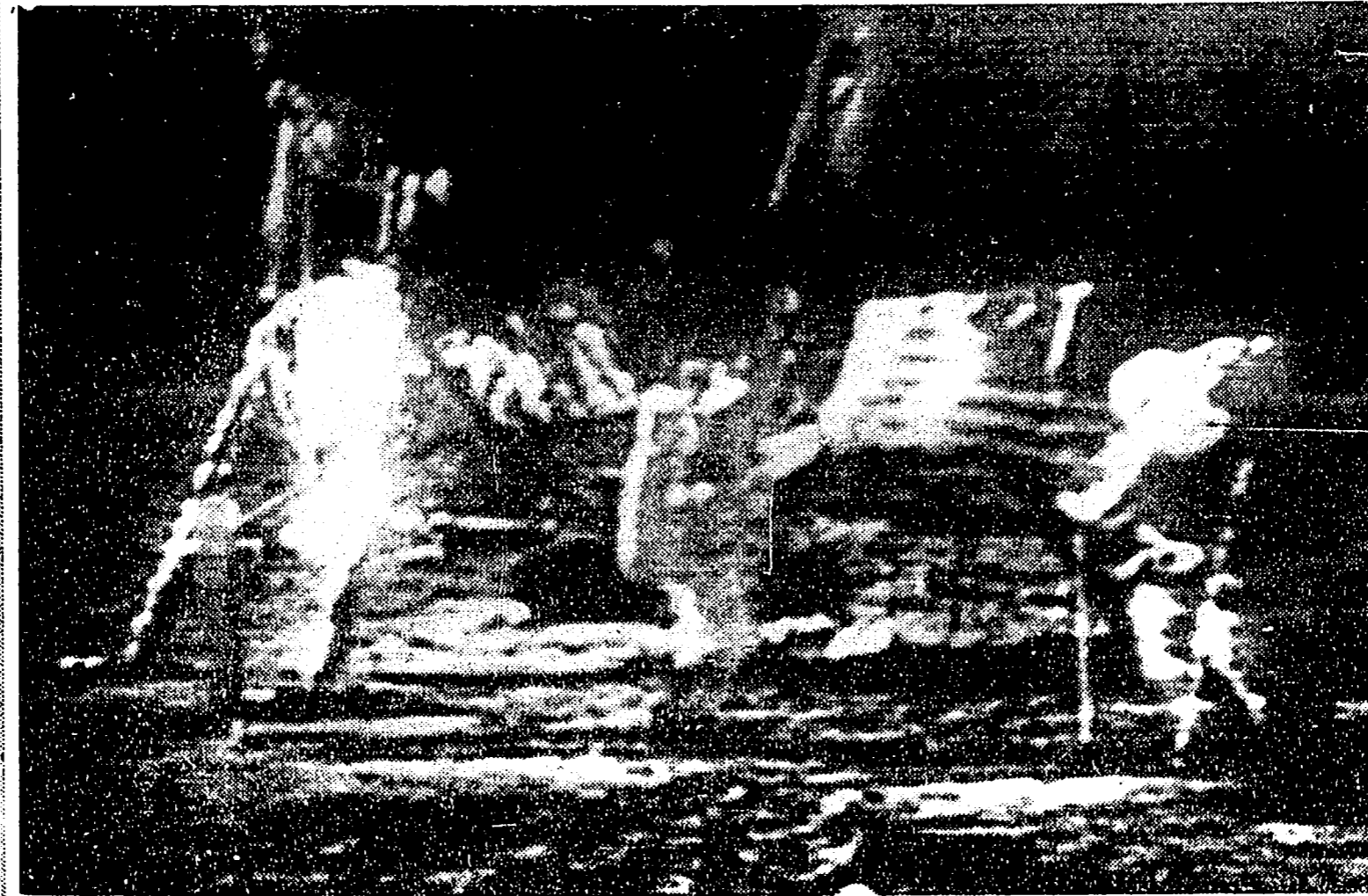
Mr. Armstrong, right, and Colonel Aldrin raise the U.S. flag. A metal rod at right angles to the mast keeps flag unfurled.