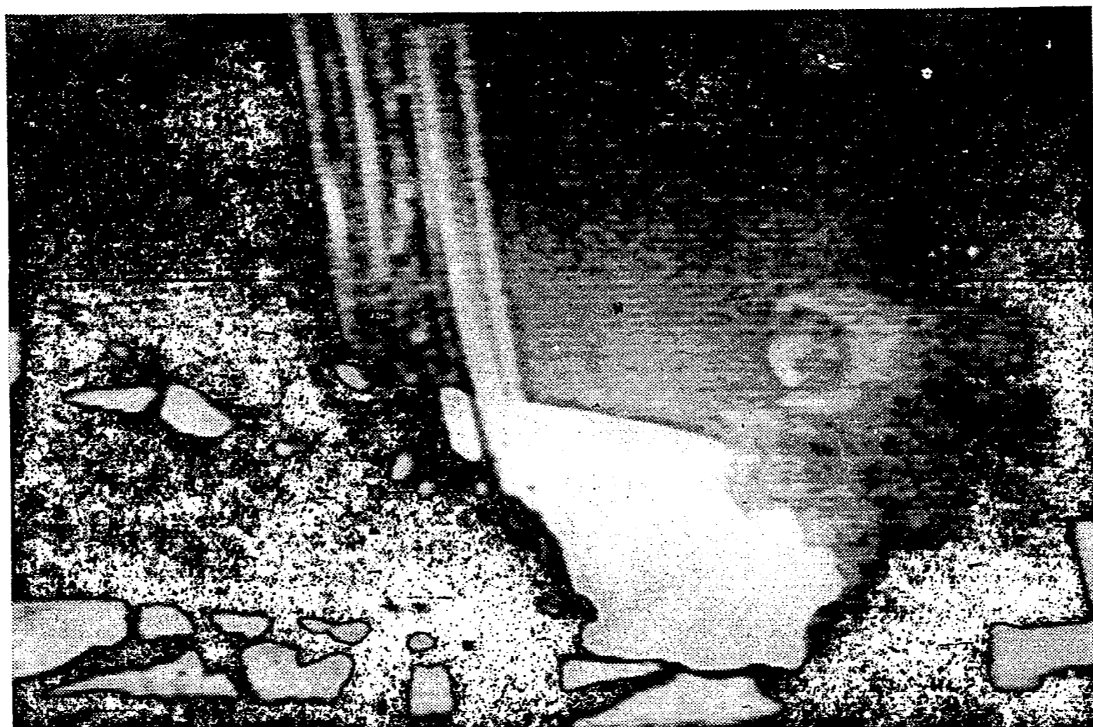
Neil A. Armstrong moves away from the leg of the landing craft after taking the first step on the surface of the moon

Over us on these silent beaches the bright earth, presence among us